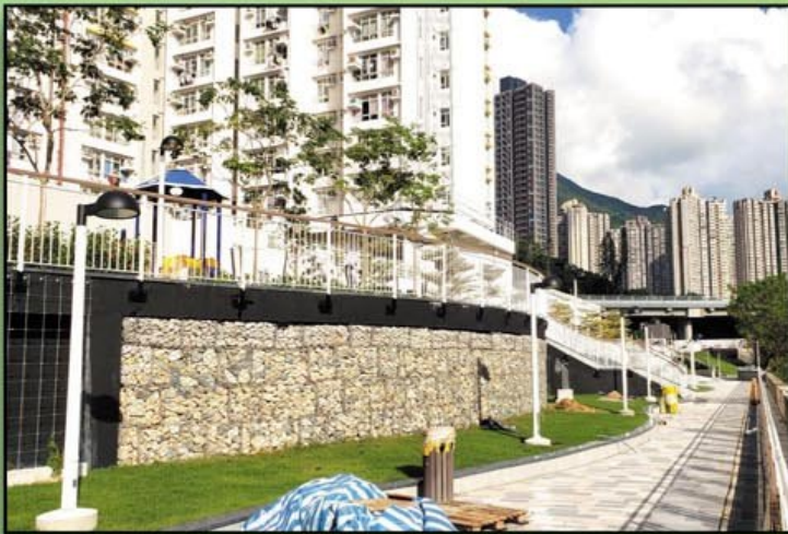
Shek Mun Estate (HKHA20150032) Gabion Esthetic Wall, August 2019 碩門邨美術設計石籠