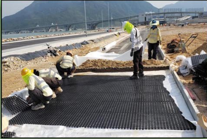
Tuen Mun - Check Lap Kok Link (HY/2017/10) Hydrocell Drainage layer, August 2020 屯門至赤鱸角道路排水板