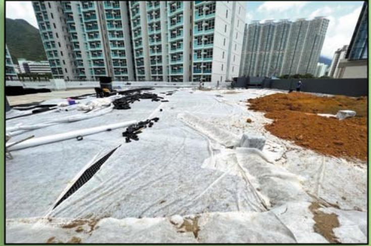
Tung Chung Area 54 (HKHA20180305) Geotextile Planter Drainage, July 2022 東涌屋宇發展花槽排水土工布