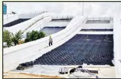
Geocell, roof garden planting soil retention at Kai Tak Nullah, May 2018 土工格室盛放植物花泥