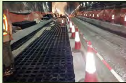
Cavidrain tunnel invert drainage, MTR Admiral South Overrun Tunnel, Apr 2017 地下鐵隧道排水板