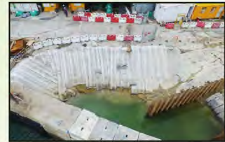
Concrete Canvas, temporary seawall protection at Tseung Kwan O - Lam Tin Tunnel Road P2, Sep 2016 混凝土襯裡海坡保護