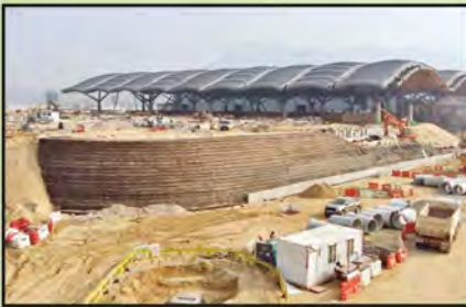
Geogrid reinforced 70° fill slope, HKZMB BCF Vehicle Clearance Plaza, Jan 2017 格柵加筋70度填土斜坡