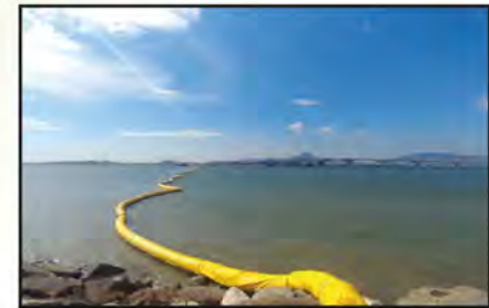
Silt curtain, turbidity control at Tung Chung New Town extension reclamation, Apr 2018 海事工程隔泥幕