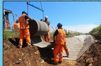
Laying of Concrete Canvas