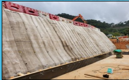
Conservation Building at Kadoorie Farm