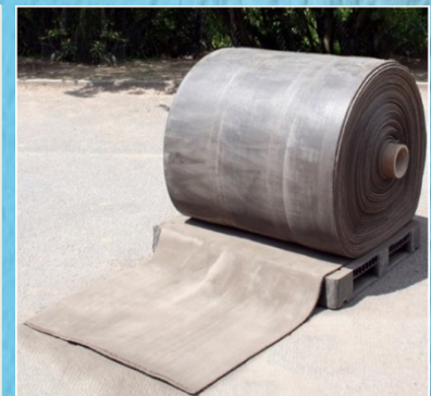
Bulk Roll (1m W x 200m L)

The roll comes in 1 m width and is manually manageable. Bulk roll of 2 – 3 m width are available. Once unrolled, laid and secured, water can be sprayed to saturation and it will set in a 1 - 2 hours, hardened in 24 hours and will continue to gain strength up to 40 Mpa, typical concrete behavior and characteristics.