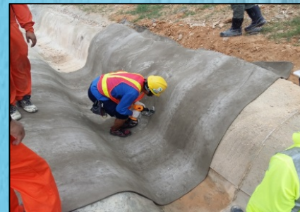
Drainage Channel Concrete Lining at SENT Landfill (EP/SP/10/91)