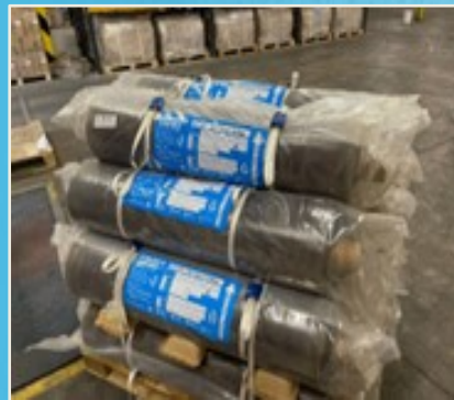
Batch Roll (1m W x 10m L)