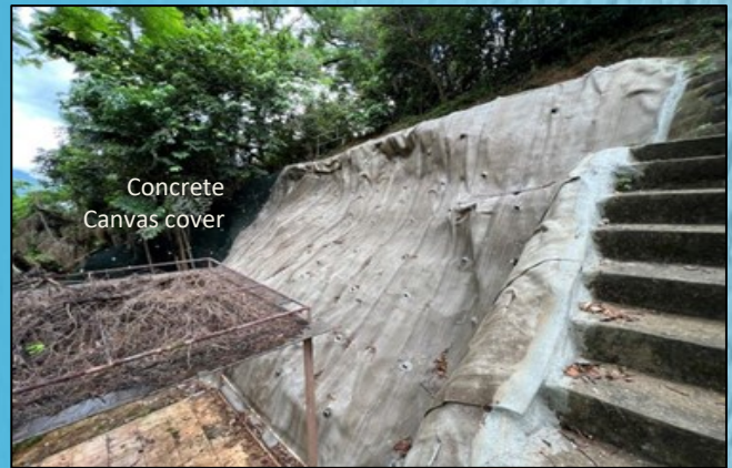
Concrete Canvas cover

Maintenance Works on Slopes in the Northern Regions, 3/LANDS/20, July 2022