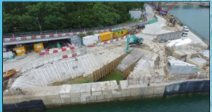
Temporary Seawall Protection at TKO – Lam Tin Tunnel (NE/2015/02)