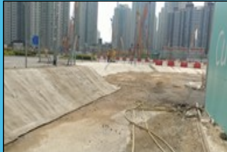
Slope Protection at Kai Tak (KL/2012/02)