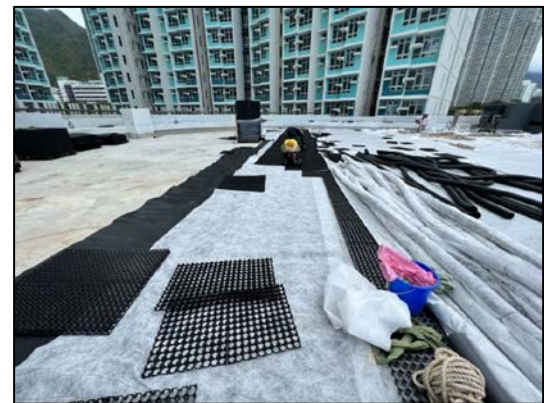
Planter drainage at Tung Chung Area 54, July 2022 (HKHA20180305)