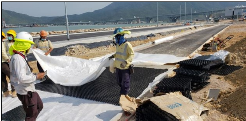
Drainage layer at Tuen Mun – Chek Lap Kok Link, August 2020 (HY/2017/10)